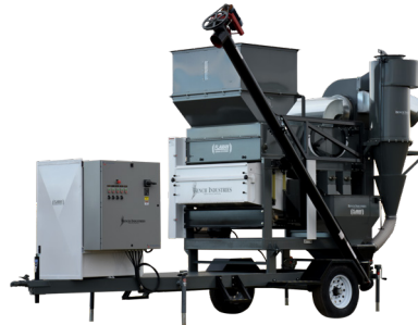
BENCH FULL SIZE MOBILE UNIT