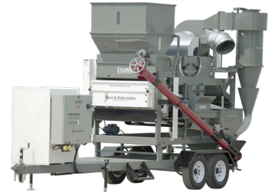
BENCH 54108 MOBILE UNIT