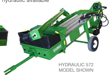
HYDRAULIC 572 MODEL SHOWN

Comes with one set of screens of your choice